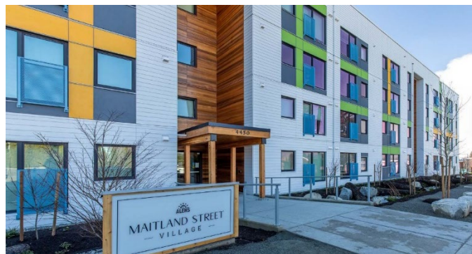
Maitland Street Village, Port Alberni