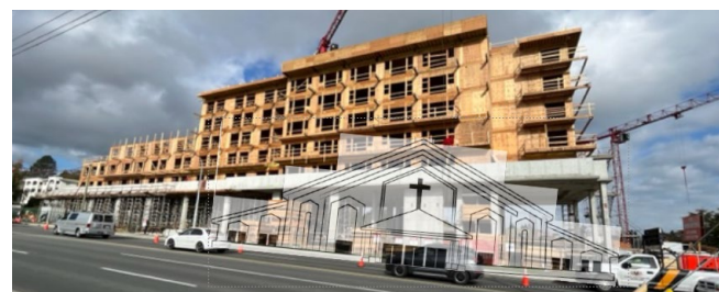
Imagining church design incorporating housing