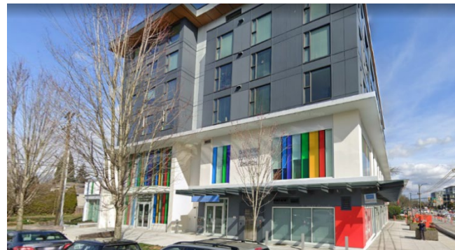
Oakridge Lutheran Church