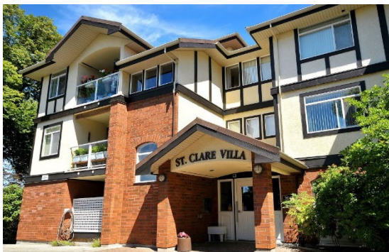
St. Clare Villa, Victoria